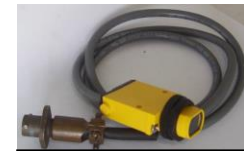
Photocell P/N 12900 Speed sensor for tail rotor