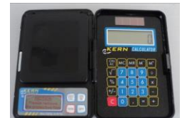
Gram Scale Pocket P/N 11245-1