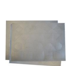
Geometric target set P/N 3712