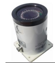
Optical blade tracker Fastrak P/N 11800-3