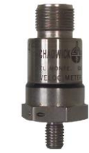
Velocimeter P/N 7310