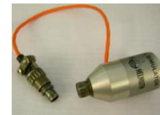
Signal simulator P/N 9850 To test Vibrex channels