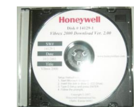
Program Vibrex 2000 Combo Download plot P/N 15178