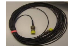
Cable Tracker 50ft P/N 11247-50 or 100 50Ft or 100Ft length