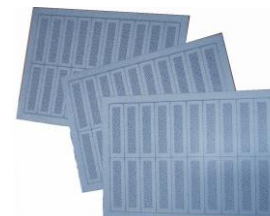
Reflective target laminated set P/N 4270A