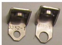
Bracket Velo .28 P/N 3382-1 Bracket Velo .38 P/N 3383-1