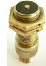
Magnetic Pickup Model 3030 P/N 5876