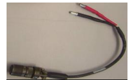
Cable DC power (CH 3140-555) P/N 11121