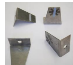
Tip Target set P/N 3387