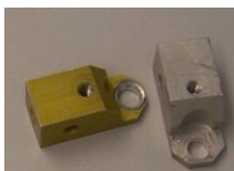
Block triax (300-80) P/N 10329-2 and Block triax (300- 80) P/N 10329-1