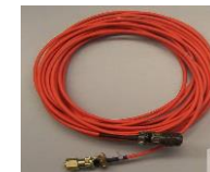
Cable Velocimeter P/N 11210-20, -50, -100 20Ft, 50Ft or 100Ft length