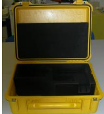
Case Vibrex 2000 Helicopter P/N 13842