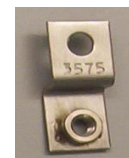
Bracket velocimeter parallele P/N 3575