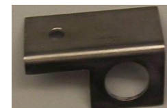
Bracket photocell Generic P/N 10423-1