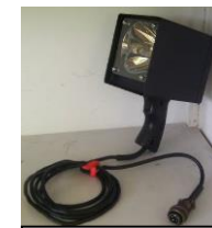
Strobex 135M12 P/N 8620