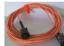
Cable M/PU P/N 10808-25 or -50 25Ft or 50Ft length