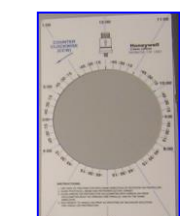
Protractor Vibrex P/N 13871