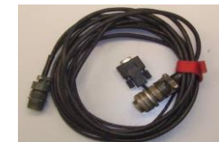
Cable Strobex for Vibrex 2000 P/N 13797