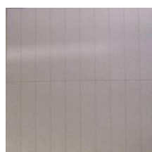
Target patches Reflective set P/N 10444